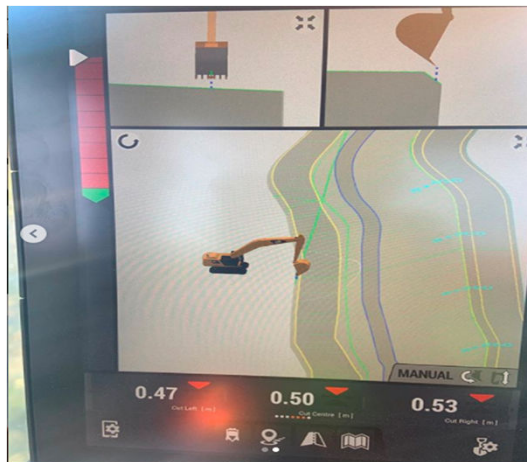
2 Dimensional grade control for excavators – similar to lane departure

Grade control systems use information gathered from global navigation satellite systems . This innovation allows Certainty to accurately position the excavator bucket in real time, eliminating line strikes.